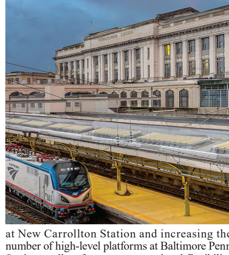
at New Carrollton Station and increasing the number of high-level platforms at Baltimore Penn Station to allow for greater operational flexibility and expansion of train service. Amtrak is also working to upgrade the last of three tracks between

Amtrak is building the foundation for its Northeast Corridor Vision and NextGen high-speed rail with several projects, which form the core of its near term investment strategy. These projects upgrade infrastructure to increase track capacity, improve ride quality, and offer greater reliability along the Northeast Corridor. A new equipment order for high-speed trainsets, in partnership with the Federal Railroad Administration, is intended to expand the Acela fleet in the near term and meet the long term operational needs of NextGen high-speed rail service in the future. The trainsets are planned to be introduced into revenue service in 2021. In preparation for the introduction of the new Acela fleet, Amtrak is taking steps to improve its infrastructure for all users and keep Acela the preferred choice for intercity travel in the Northeast. While many of the infrastructure improvements will take place on the south end of the Northeast Corridor, between Baltimore and Washington, DC, the enhancements will benefit the full length of the corridor. In general, Amtrak will be constructing a new side high-level platform